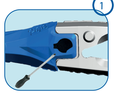
Removing protective caps: Before disassembling the pin, remove the protective cap using a flathead screwdriver, and clean any material in the pin head, so that the removal tool's appendix can be properly inserted into the pin.