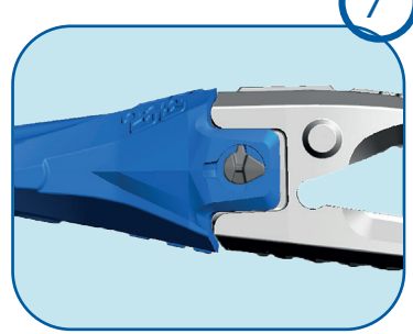
Correct positioning : Pin is correctly installed when the pin will be locked as shown.

Do not force beyond the mechanical stop, as this is impossible.