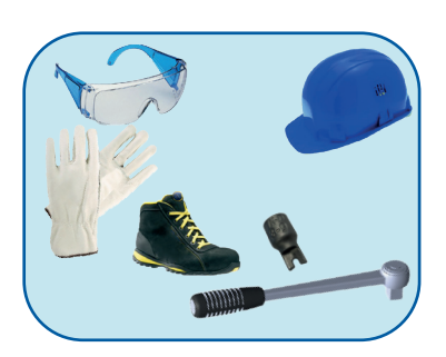
Equipment : The use of the TK D 3-9 tool is recommended for TURNKEY® Grizzly teeth assembly/disassembly. Always work safely and wear your safety equipment (hard hat, steel-toed shoes, gloves, safety glasses). Keep bystanders away.