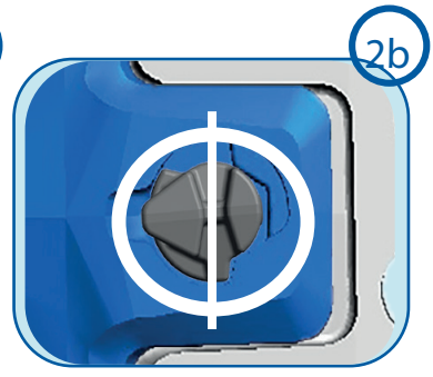
Correct unlocking (2) : Once unlocking is complete, your pin should be in this position in this position: Head Left