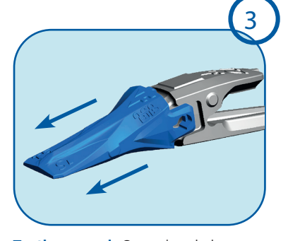
Teeth removal : Once the pin is removed, you can easily remove teeth