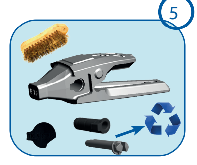
Cleaning : Clean the adaptor, the sleeve hole and throw away the used locking device.

When fitting a new tooth, use a new pin and a new sleeve.