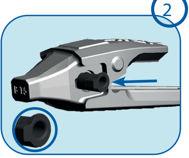
Sleeve insertion : Manually insert the sleeve. You will notice on the sleeve & the adapters some notches to make sure to respect the sleeve insertion direction.

The use of spray or silicone grease is recommended for better installation.