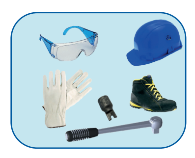
Equipment : The use of the TK D 3-9 tool is recommended for TURNKEY® Grizzly teeth assembly/disassembly. Always work safely and wear your safety equipment (hard hat, steel-toed shoes, gloves, safety glasses). Keep bystanders away.