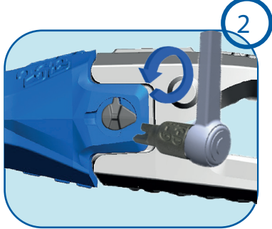
Unpinning: Once the TK D 3-9 clamping sleeve has been inserted into the pin head, unlock the pin by turning it counter-clockwise through 180°. Then lever out the pin with a screwdriver.