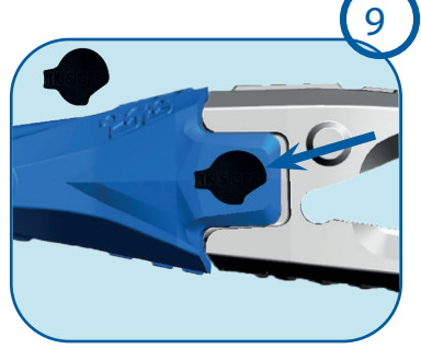
Protective caps installation: On right teeth sides, insert the protective caps to avoid fines to fill up the pin hole. These protective caps will allow you to decrease teeth replacement time.