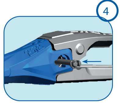
Pin insertion : Once the teeth is correctly installed on the adapter, insert the pin into the key hole while respecting the insertion direction (pin head left), then push it to the end.

The pin as well as the sleeve have mechanical codings to avoid any incorrect insertion.