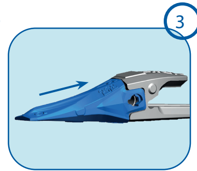
Tooth assembly : Install the TURNKEY® Grizzly tooth on the adapter.

The use of spray or silicone grease is recommended for better installation.